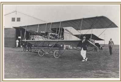
About 4 km off the N8, on General van der Spuy Drive.